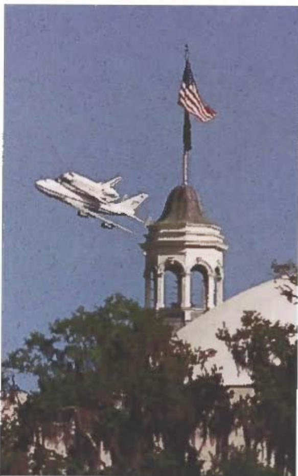
The space shuttle Discovery flying over Florida's Capitol, 1992

also has become more diverse. Tourism, cattle, citrus, and phosphate have been joined by a host of new industries that have greatly expanded the numbers of jobs available to Floridians. Electronics, construction, real estate, international banking, and biomedical research are among the state's more recently developed industries.